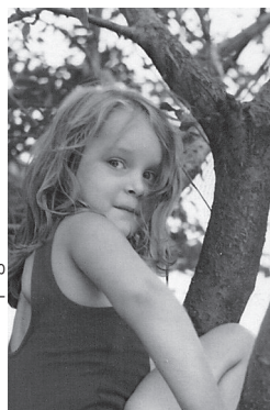
answer on page 4